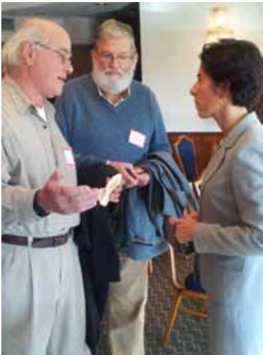
Treasurer Raimondo (right) speaks with guests at the conclusion of the breakfast meeting

General Treasurer Gina Raimondo addressed a crowd of about 100 attendees at a breakfast held at the Village Inn on Friday, October 28.